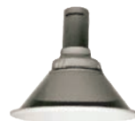
Domed Hood 14" diameter x 2"Ø or 3"Ø Hose