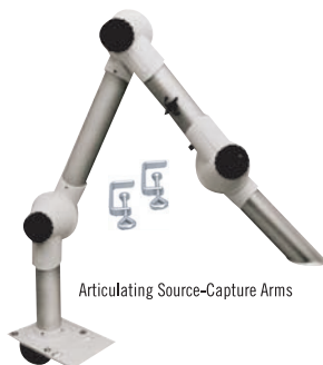
Articulating Source-Capture Arms