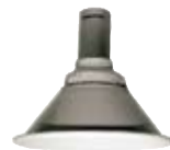
Domed Hood 14" diameter x 2"Ø or 3"Ø Hose