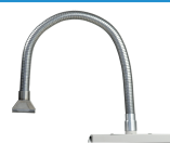
FXA-36-31 Stainless Steel Flexible Arm